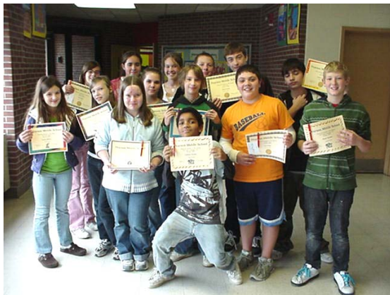
7 th Graders celebrate winning Student of the Month honors!!